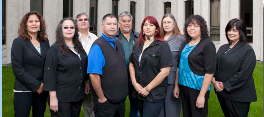
Current Board of Directors for Tyonek Native Corporation